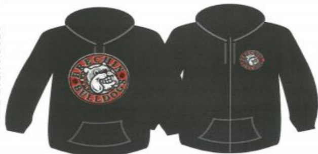
ZIP UP HOODY