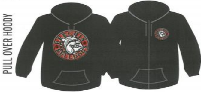
PULL OVER HOODY